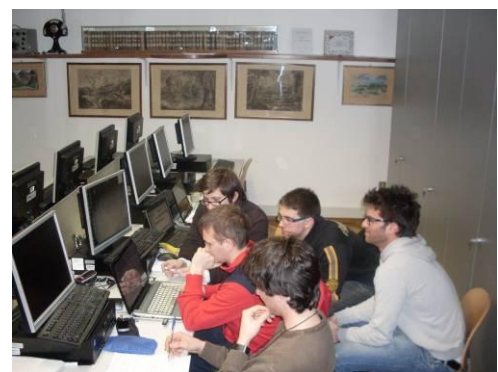
The PC Lab