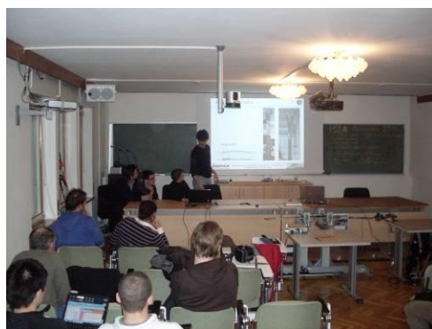
The Main Lecture Hall